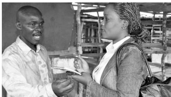
Media has a role to play in development, interview of market manager during Business Unusual, Tanzania.

At the heart of change highlights why communication cannot be left to look after itself but, rather, needs support from development organisations. One broad area to consider is that governments and traditional media need support as they struggle to keep up with the rapidly evolving challenges of new communication technologies. For governments, these ICTs are revolutionising their relations with their citizens; for media, the challenge is to redefine the role of professional journalism within the plethora of unmediated individual voices in the blogosphere.